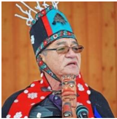
Chief Na'Moks – Wet'suwet'en nation, so-called Canada Fighting the violation of indigenous rights in the Wet'suwet'en nation Language: English